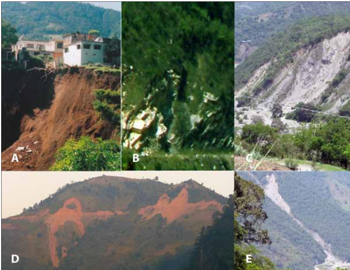
Figure 3. Main types of mass movements processes in the studied area.

The natural mechanisms of slope instability are usually seismicity, volcanic activity and rainfall, but nowadays in the Pahuatlán area the only mechanism that leads to mass movements is rainfall; this may be high-frequency and low-magnitude rainfall that occurs for several hours or even days, or low-frequency and high-magnitude rainfall due to extraordinary storms or provoked by larger systems such as tropical storms and/or hurricanes.