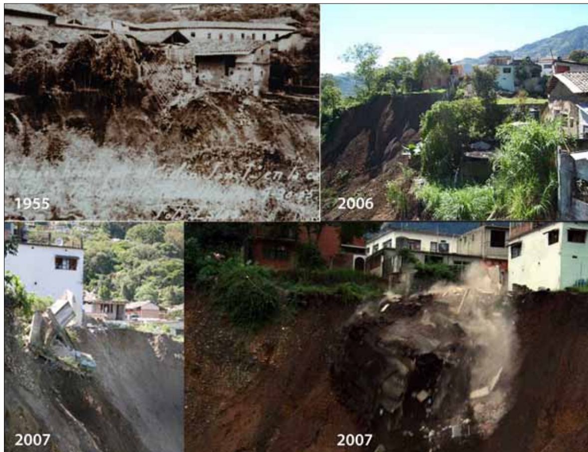
Figure 4. Some of the instability processes that have occurred in the Pahuatlán area.